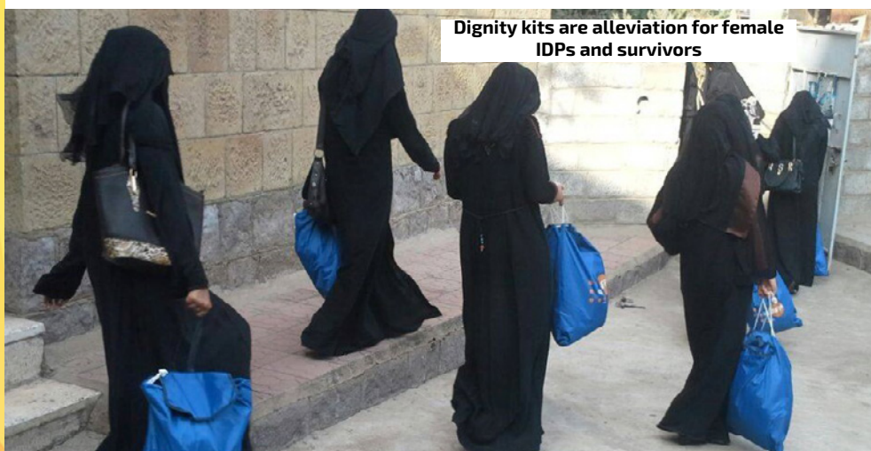
Dignity kits are alleviation for female IDPs and survivors

and preserve their dignity during displacement. It aimed at contributing to secure part of the basic needs for female IDPs and to alleviate their suffering and psychological side-effects besides the difficult livelihoods in the current circumstances of the country. Partner NGOs have contributed in the distribution of the Dignity kits in number of Yemeni governorates with the YWU. Care International distributed the kits in Lahj while the Yemeni Association for Reproductive Health (YARH) took care of Sana'a and Hodeida. The Humanitarian Forum Yemen (HFY) distributed the kits in Ibb, Hodeida and Amran whereas All Girls take over Hodeida and finally Bani AL-Hassani Charitable Society in Rayma.