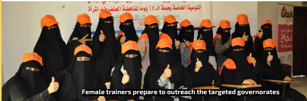
Female trainers prepare to outreach the targeted governorates