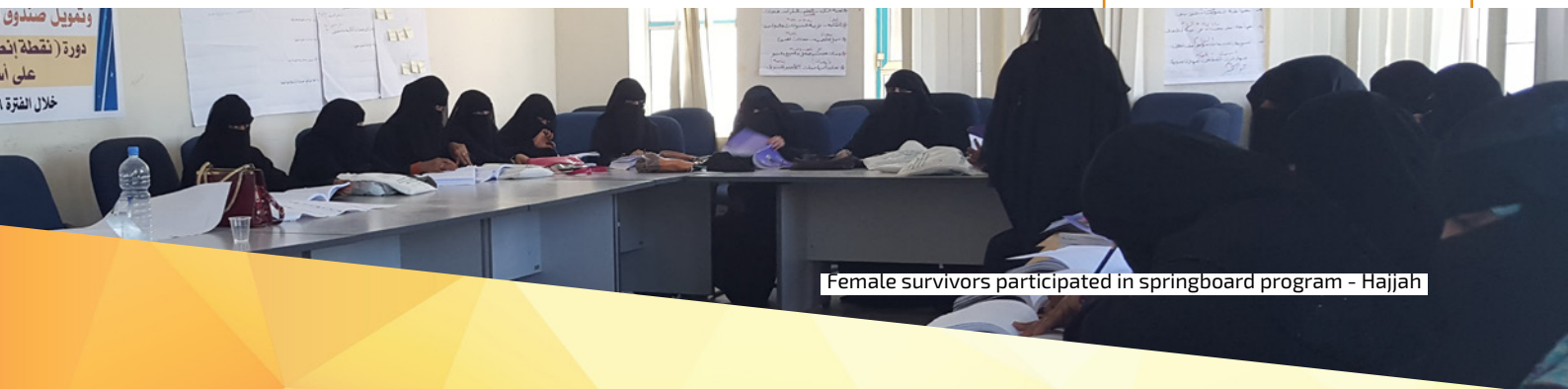
Female survivors participated in springboard program - Hajjah

Ms. Muraisi said to "Najoon Online" that the YWU concentrates on the importance of the safe education for everyone and dissemination of peace and awareness within the community through their purposeful activities and programs in the near future